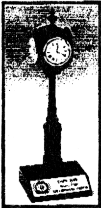
CHESTER Shown on Header 4 Working Swiss Made Quartz Movements