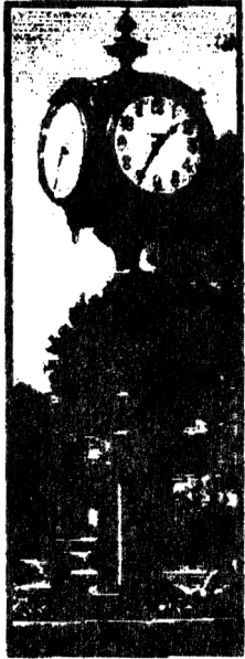
Sample Rendering of Proposed Clock

$1,000 - Receive an Operating Miniature Clock On A Desk Set And Your Name Inscribed on The Full Size Clock