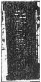
Town Clock Plaque